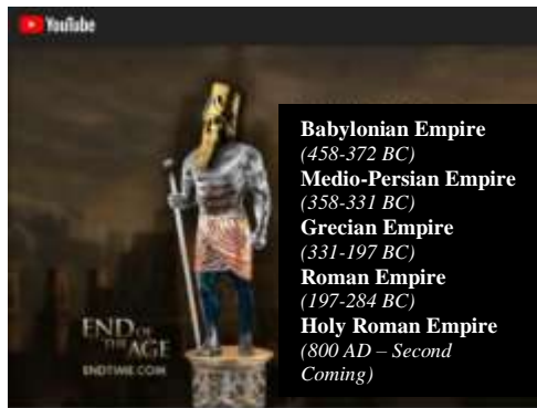
End times Holy Roman Empire Reborn part7